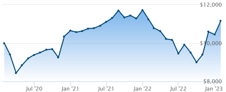
■ BMO MSCI EAFE ESG Leaders Index ETF (ESGE)