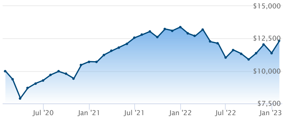
■ BMO MSCI Canada ESG Leaders Index ETF (ESGA)