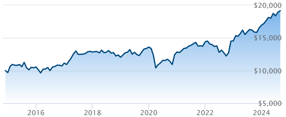
BMO International Dividend ETF (ZDI)