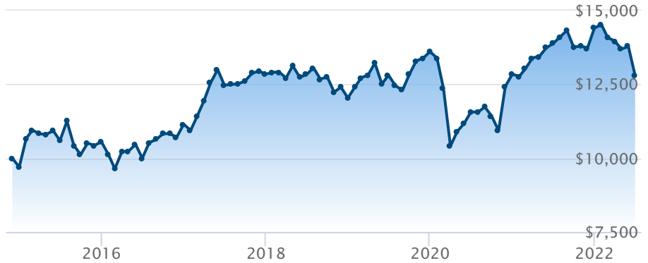
■ BMO International Dividend ETF (ZDI)