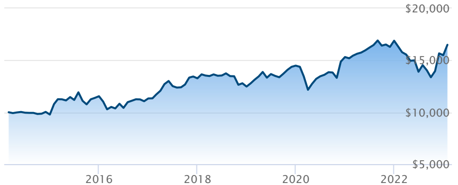
■ BMO MSCI EAFE Index ETF (ZEA)