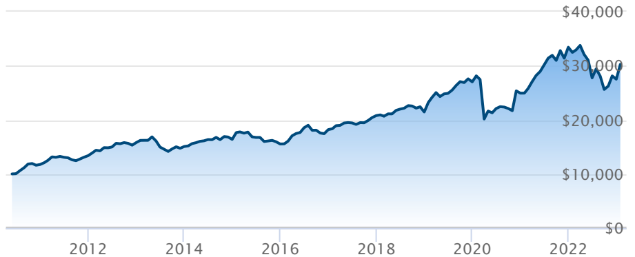
■ BMO Equal Weight REITs Index ETF (ZRE)