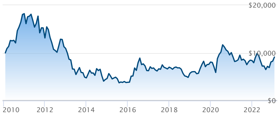
■ BMO Junior Gold Index ETF (ZJG)