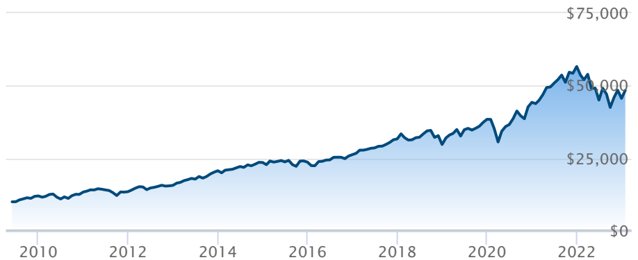
■ BMO S&P 500 Hedged to CAD Index ETF (ZUE)

Past performance is no guarantee of future performance. All returns are historical annual compounded total rates of return and reflect changes in yield and distributions reinvested. Managed Indexed, Managed Portfolios and Market Indexed accounts credit an interest amount mirroring the net rate of return of a specified underlying investment, less a BMO Life Assurance Company daily management fee. These rates of return do not reflect the current BMO Life Assurance Company management /universal life fee which must be taken into consideration when determining the net return earned on the account.