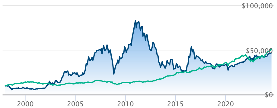
AGF Global Real Assets Fund Mutual Fund Series Funddata Global Balanced - Equity Focus Index

The information contained on this page is related only to the designated fund or funds shown above. As part of a BMO Life Assurance Company policy, you do not purchase units in this designated fund or a legal interest in any security.