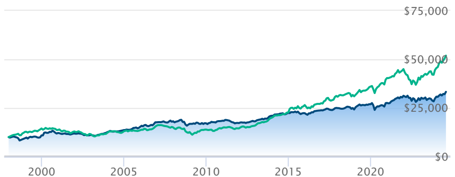
AGF Global Strategic Income Fund MF Series Fundata Global Balanced - Equity Focus Index

The information contained on this page is related only to the designated fund or funds shown above. As part of a BMO Life Assurance Company policy, you do not purchase units in this designated fund or a legal interest in any security.