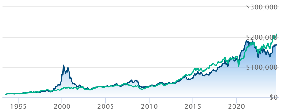
AGF U.S. Small-Mid Cap Fund Mutual Fund Series Dow Jones U.S. Small-Cap TR Index (C$)

The information contained on this page is related only to the designated fund or funds shown above. As part of a BMO Life Assurance Company policy, you do not purchase units in this designated fund or a legal interest in any security.